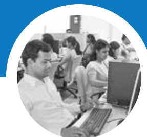
Offshore Development Centre