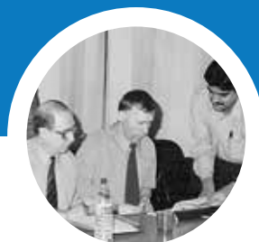
On Site Project Team