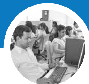
Offshore Development Centre