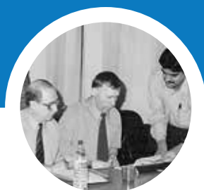
On Site Project Team