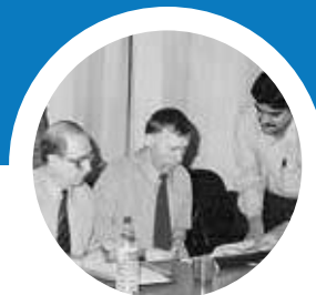
On Site Project Team