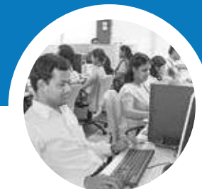
Offshore Development Centre